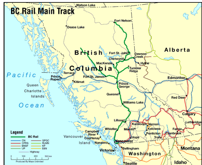
Figure 1. Route Map for CN in British Columbia

Canadian National Railway (CN) is one of the largest Class I railways in North America operating roughly 20,000 miles of mainline track between the Gulf of Mexico and Canada, and across Canada. In addition to two mainline tracks in the mountainous Canadian west coast province of British Columbia, CN also operates some 1,455 miles of the former BC Rail network (Figure 1). The rugged British Columbia terrain dictates that railways are typically located along the valley bottoms of major river systems with numerous adjacent rock cuts or steep natural rock slopes that are subject to considerable seasonal variability in temperature and precipitation. These features have made British Columbia the most active area on CN’s system for rockfall hazard. Between 1995 and 1997, CN, in collaboration with BGC Engineering Inc. and Oboni Associates Inc. (BGC, OA), developed a rockfall hazard risk assessment rating system (CN RHRA rating) and implemented it on mainline track in mountainous terrain in Western Canada. This paper reviews the methodology of the CN RHRA, describes enhancements to the system based on nearly 10 years of development and use, and outlines how the rating system has been incorporated into a fully developed risk management system for railway rockfall hazard. The paper concludes with a discussion of possible future system enhancements.